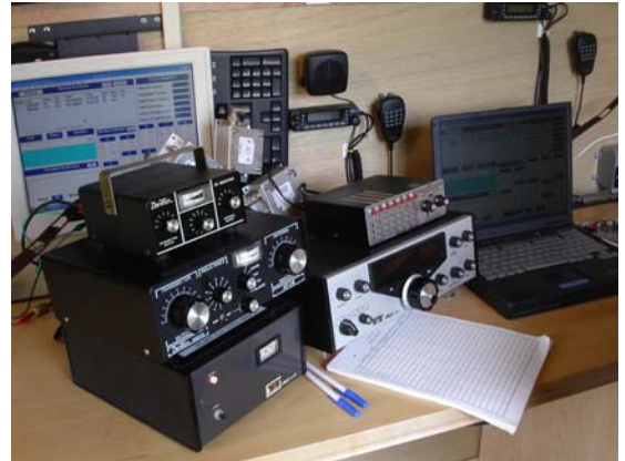
Field Day CW set up including computer, tunners & electronic key